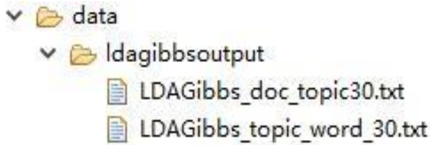
Figure 2: The output results of the collapsed Gibbs sampling for LDA