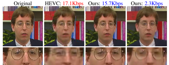
Fig. 3: Qualitative evaluation against HEVC on Deadline sequence in a low bitrate setting.

age BD-MOS = 1.68, BD-rate = -82.35%). In Fig 2-right, we report the Pearson Correlation Coefficient (PCC) and the Spearman Rank-Order Correlation Coefficient (SROCC) between MOS and five commonly used quality metrics, for our codec and HEVC. We observe that, except VIF, these metrics correlate well with human judgment, at least on the tested data. Based on these preliminary results, we proceed with an extensive performance evaluation of the proposed method using these quality metrics. In Table 1, we report the average Bjontegaard-Delta performance for VoxCeleb test and Xiph.org images. The gains are significant (over 80% BD-rate savings) on the two datasets.