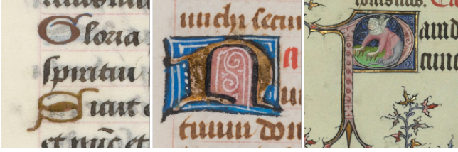
Figure 4: Three types of ornamental initials : simple initials, decorated initials and historiated initials.

meaning beyond the alphabetical letter. The distinction is similar to the one between decorated and illustrated borders.