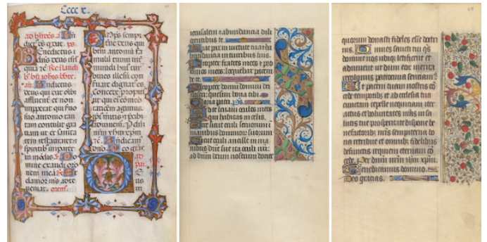
Figure 3: Examples of decorated borders.

illustrated_border, while one depicting flowers or random animals would not.