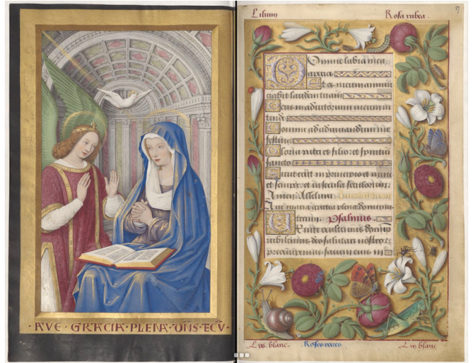
Figure 1: Two pages from the book of hours in latin "Grandes Heures d'Anne de Bretagne", Bibliothèque nationale de France. Département des Manuscrits, Latin 9474.

© 2019 Copyright held by the owner/author(s). Publication rights licensed to ACM. ACM ISBN 978-1-4503-7668-6/19/09...$15.00 https://doi.org/10.1145/3352631.3352633