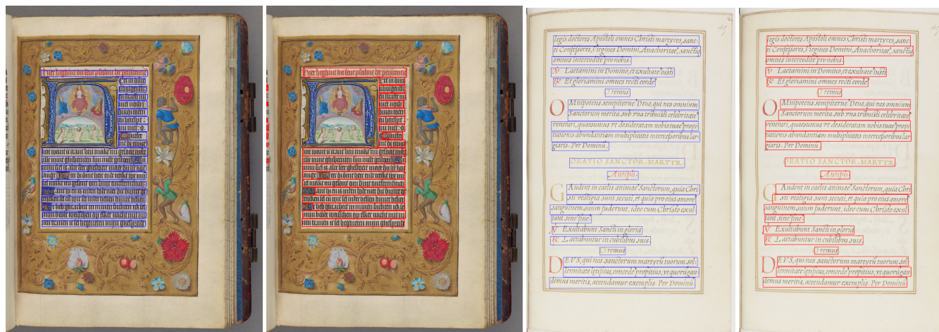
Figure 5: Examples of line segmentation on test pages. On the left, the manuscript pages with the ground-truth and on the right the pages with the classes predicted by the model.