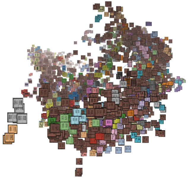
Figure 2: Visualization of the clustered pages in the 3D-space. A PCA has been performed over the 5,738 images. We show here the result of the clustering step: the pages belonging to the same cluster are highlighted in the same color. We can see that the pages that share a similar layout are assigned the same cluster. For example, the three images in yellow (on the left of the image) belong to the same cluster. During the selection step, only one image within this cluster of three images is kept. The images highlighted in brown are the ones defined as outliers. See https://page-projector.horae.digital/ .