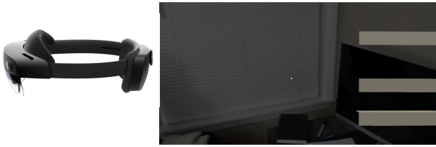
Fig. 3: Prototype of an AR-capable metronome developed based on Unity and deployed on a Hololens 2 headset.

Technologies to connect the glasses wirelessly (e.g., Bluetooth, WiFi) to the tablet may be useful, however, still such glasses have limited capabilities in terms of graphics. A direction that is worthy of exploring is the integration of AR to provide immersive graphical experience that enhances the research participant's perception of the world. In Figure 3, we present an early prototype of an AR-based metronome that we implemented based on Unity. We have deployed this prototype on a Hololens 2 headset. This metronome is a direct conversion of the metronome of Figure 2 to an AR environment.