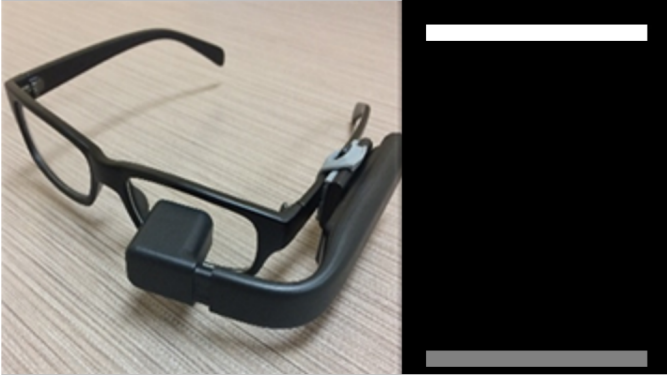
Fig. 2: Prototype of visual metronome. A moving bar depicted on right hand side is displayed on a video screen mounted to a non-prescription pair of glasses.