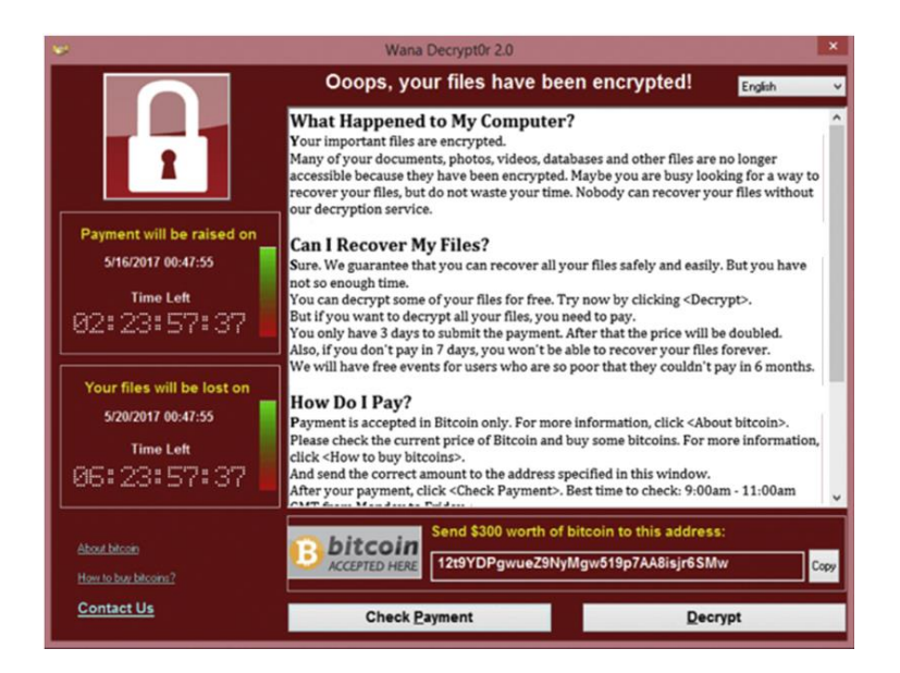
Fig. 1. Screenshot of WannaCry Ransomware [6]

There has been several incidents and news regarding hacking, especially the recent WannaCry ransomware (Fig. 1) which happened across the world, especially the hospital in the UK [6], in which their information was encrypted and unrecovered. The culprit is due to Windows ability to update and the hospital was running on an old firmware and current running on outdated software. The figure below was a screenshot of a ransomware pop up indicating that the ransomware software is running the background.