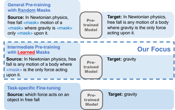
Figure 1: Motivating Example. Intermediate pre-training using salient span masking is helpful in improving closed-book QA performance (Roberts et al., 2020). We propose to use a learned masking policy during intermediate pre-training to pack more task-relevant knowledge into the parameters of LM.

Prior work has shown that large, neural language models (LMs) have a remarkable capability to learn knowledge from pre-training, which is stored implicitly within their parameters (Petroni et al., 2019). This encoded knowledge allows LMs to perform a wide variety of knowledge-intensive tasks without an external knowledge base, including knowledge base relation inference and fact checking (Petroni et al., 2019; Lee et al., 2020). The implicit knowledge capacity can also be tested in the form of question answering, in the task termed as “Closed-book QA” (Roberts et al., 2020). By directly fine-tuning the LM with (question, answer)