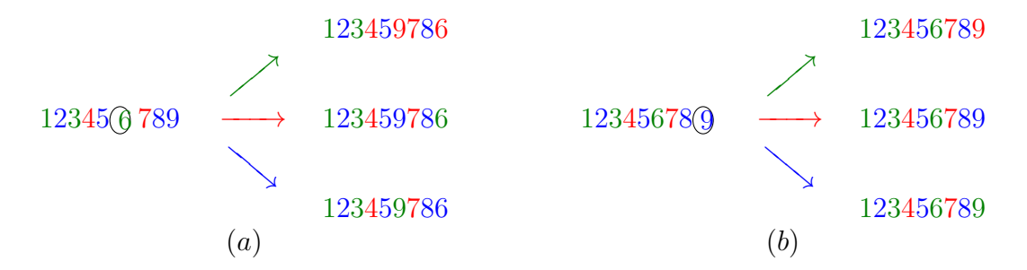
FIGURE 1. Transitions for the warp-transpose top with random shuffle on \mathbb{Z}_3 \wr S_9 . \mathbb{Z}_3 is the additive group of integers modulo 3, consists of the colours red, green and blue such that red represents the identity element. (a) shows transitions when the sixth card is chosen and (b) shows transitions when the last card is chosen.