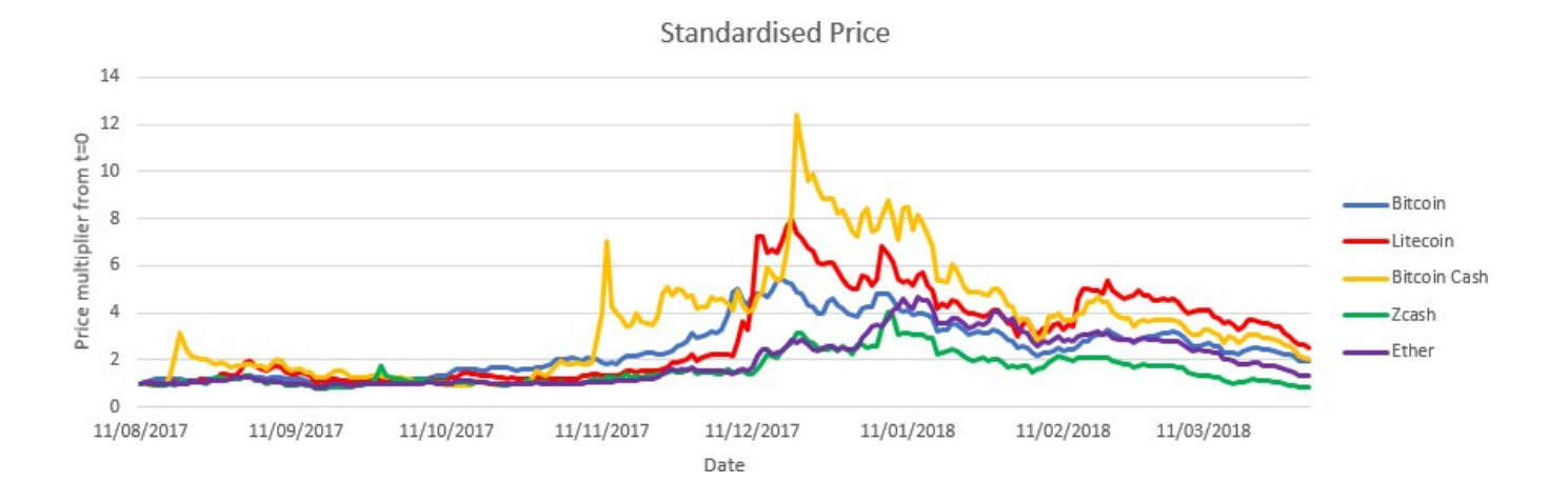
Figure 2: Log standardised prices ("daily high", see text) of cryptocurrencies from 11/08/2017 to 1/04/2018.

Figure 1: Annotated events, December 2017 – January 2018 Bitcoin rally.