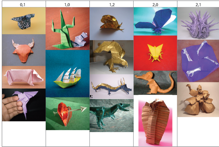
Figure 4: A collection of images that were wrongly classified. The first number in each column represents the labeled difficulty, while the second number represents the predicted difficulty.

We found that an SVC with a polynomial kernel with C = 0.1 provided the highest possible score, giving us a balanced accuracy of 0.7913 \pm 0.0219 . Figure 4 shows several of the images that were classified incorrectly using these parameters for the SVC.