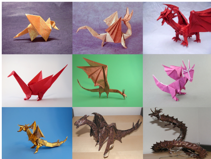
Figure 1: For some model topics, (such as dragons, Santa Claus, pandas, etc.), there are multiple models that were meant to represent the same topic. This example contains 9 different dragon models [1, 14].