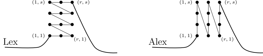
Figure 2: The snakes Lex and Alex passing through \{1, \dots, r\} \times \{1, \dots, s\} .

By definition, A_M is a pseudo-object with indexing set \text{Sn}(Z) consisting of (isotopy classes of) snakes passing through Z = \{1, \dots, r\} \times \{1, \dots, s\} . Among such snakes we distinguish the lexicographic snake Lex which reads the elements of Z one by one horizontally and the antilexicographic snake Alex which reads them one by one vertically, see Fig. 2. The corresponding determinations of A_M are