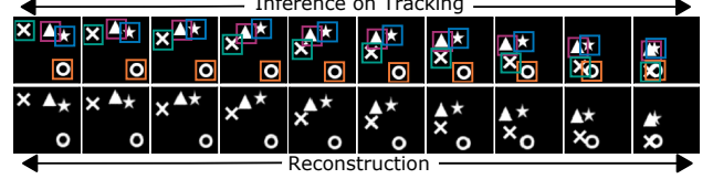
Figure 3: Qualitative results for the tracking task: Top row shows inferred positions of objects, bottom row shows reconstruction of the video frames.

and similarly approximate the gradient of the forward KL divergence with a self-normalized estimator that is defined in terms of the proposals c_1^l, \tau_1^l, \rho_1^l, w_1^l \sim q_1(c_0) ,