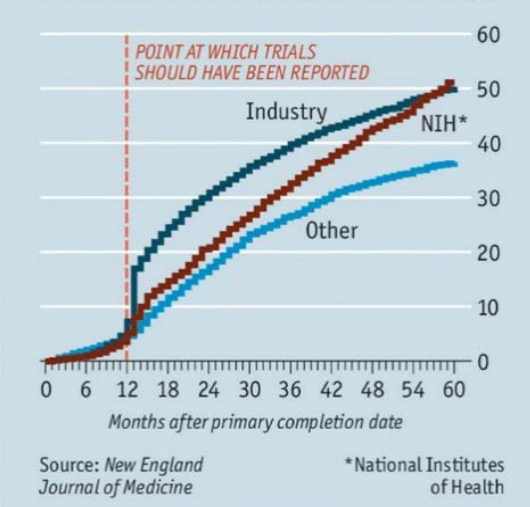
Figure 3. Cumulative percentage of test results published after completion, Source: The Economist, 25 July 2015.

Cumulative % of trials reported to ClinicalTrials.gov