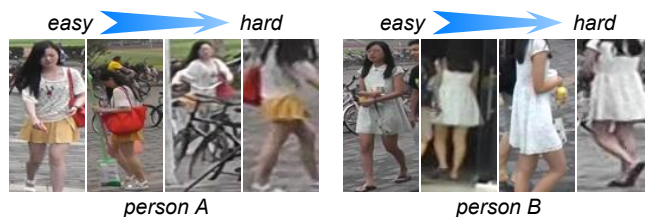
Figure 1: Illustration of the self-discrepancy of intra-class relations for UDA person re-ID tasks, which is caused by variations in pose, viewpoint and occlusion, etc. For each identity, some easy samples can be assigned with reliable pseudo labels. However, most of hard samples are always given with noisy pseudo labels.

Given a query image, person re-identification (re-ID) aims to match the person-of-interest across multiple non-overlapped cameras distributed in different places. Encouraged by the remarkable success of deep learning methods and the availability of large-scale datasets, re-ID research community has achieved significant progress during the past few years [Zheng et al. , 2016; Ye et al. , 2021]. However, as for pedestrian images from an unseen domain, even with a large diversity of training data, person re-ID model generally experiences catastrophic performance drops because of the huge domain gaps or scene shifts, which cannot satisfy the need of application in real scenarios. To alleviate this problem,