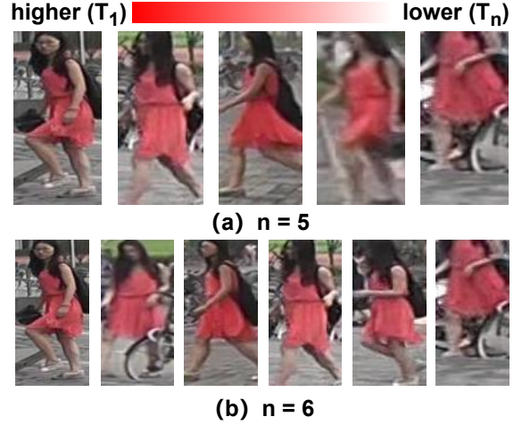
Figure 4: Visualization of the self-discrepancy under different n values. When (a) n=5 or (b) n=6 , some samples of same pedestrian in different self-discrepancy granularity repeat with others or share a high similarity.

Second, from the quantitative perspective, our qualitative observations above are confirmed by the quantitative evaluations. To be more specific, we use F-score to measure the pseudo label generation quality of our proposed MCN-MT method. As depicted in Fig. 3, the quality of pseudo labels will be negatively affected with an over-increased n . when n equals to 3, we can obtain the highest F-score on Market-1501 and DukeMTMC-reID datasets respectively, suggesting the high quality of our pseudo labels, which may be the main reason that the proposed MCN-MT can achieve the best performance when n=3 . In real-world applications, we would recommend to use n=3 .