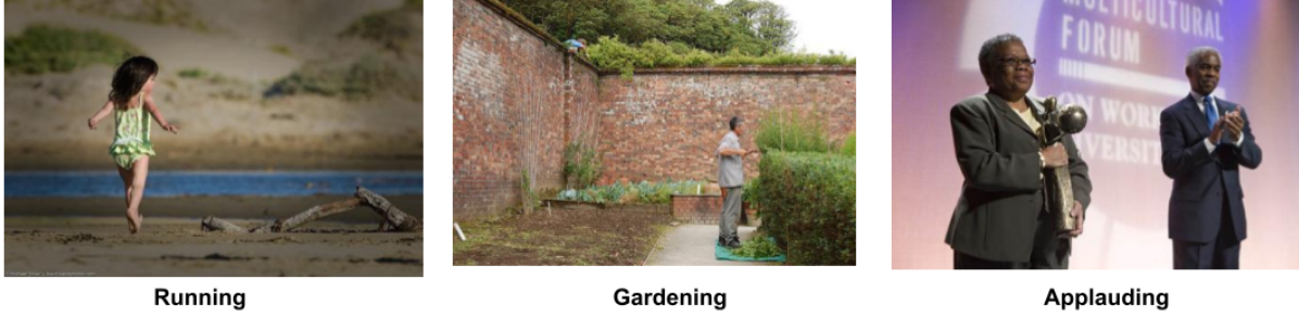
Figure 1: Summarizing a dataset (e.g. Stanford Activity [4]) with K representative images can be ambiguous. Identifying the key concepts in the data (e.g. ‘running’, ‘applauding’, ‘gardening’) is often clearer.

As a downstream application, our method can be used for conceptual grouping within image datasets. Given the K principal concepts generated in the previous stage, a zero-shot learning approach may be used to classify each image into one (and only one) of the K concepts. One advantage of this approach is the ability to guide the grouping by selection of the concept-bank. The grouping of images by activity, for instance, can be easily accomplished by selecting a concept-bank only containing descriptions of activities, forcing the images to be grouped accordingly.