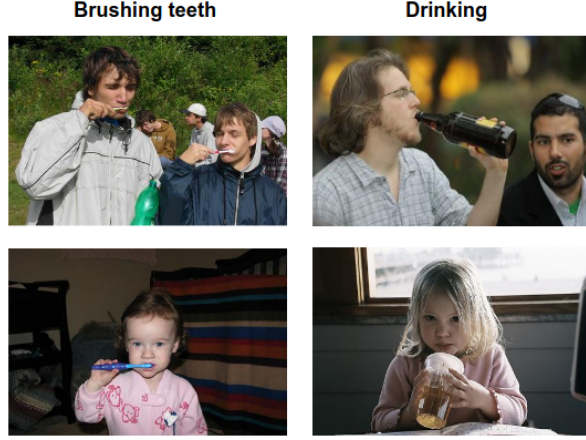
Figure 3: Four images selected from the Stanford Activity dataset. The images can be grouped by coarse-object category (‘adult humans’, ‘toddler’) or by activity (‘drinking’, ‘brushing teeth’). Our method uses a concept-bank to determine the concepts that are allowed for grouping (in this case activities: ‘walking’, ‘drinking’, ‘brushing teeth’ etc.).