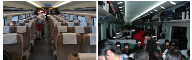
Fig. 1. Example photos of in-carriage scenario. Left – with few passengers. Right – with many passengers.

Since the typical communication services in most of the conventional scenarios include control signal, voice, data, video, etc., the experienced data rate is generally expected to reach 0.1-1 Gbps with the connection density of 10^3 - 10^4 /km along railway line.