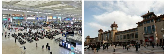
Fig. 2. Example photos of railway stations. Left – the closed area of station hall. Right – the open area of station square.

feature of T2T communication is NLOS dual-mobility with high speed, which leads to extremely time-varying and non-stationary channel and reduces communication quality. Nevertheless, it requires high reliability and low latency (1-10 ms) communications due to safety concerns for control signal of intelligent operation. In order to ensure reliable T2T communications in composite railway environments, it is important to select appropriate frequency band. Since T2T communication often occurs under NLOS condition, the carrier frequency of the system should have good diffraction property [18].