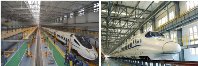
Fig. 4. Example photos of railway depot scenario.

monitoring system (including numerous sensors around 10^4 - 10^5/\text{km}^2 ) usually transmits monitoring data through cellular network such as 5G-R or through railway optical fiber system. Benefit by fiber channel, the optical fiber based railway monitoring system shows high robustness on transmission performance (0.01-0.1 Gbps data rate with 1-10 ms latency), however, deploying optical fiber system requires high cost. On the other hand, integrating railway IoT into 5G-R has more flexibility for implementation. The sensors of railway IoT are usually deployed along with railway line, and the propagation channels are affected by the complex railway environments. Hence, a well-designed railroad IoT system is critical to safety.