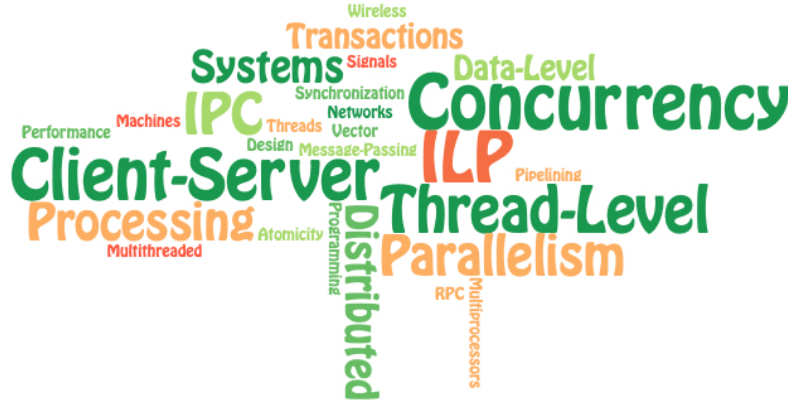
Fig. 2. PDC Topics Used by Surveyed Programs for ABET Accreditation

ecture courses can also cover concepts of shared and distributed memory;