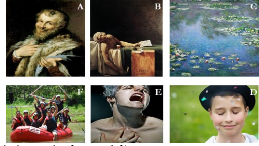
(Clockwise, starting from top-left)

For recommending image-suited music, we consider both artworks and photographs (examples can be seen in Fig. 1) and treat them differently, unlike prior work. Artworks and music appear connected not only in the common nomenclature of their movement/style (e.g. Renaissance and Impressionism in paintings and Renaissance and Impressionism in music) but also in terms of common traits that are shared between the respective movement/style [12]. Motivated from this commonality, we hypothesize that music recommended based on artwork image’s movement/style (in addition to emotion) is better suited than the music recommended based on artwork’s emotion alone. In other words, we hypothesize that the characteristics of music suiting an artwork image of a certain movement/style may be different from that of the music suiting an artwork of a different movement/style, even though these images may evoke a common emotion. In case of photographs, we utilize image’s emotion alone (similar to [6] [10]) for recommending music. We