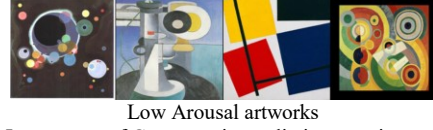
Fig. 4: Importance of Geometry in predicting emotion. Artworks (in public domain) from [21] (Best viewed in color)