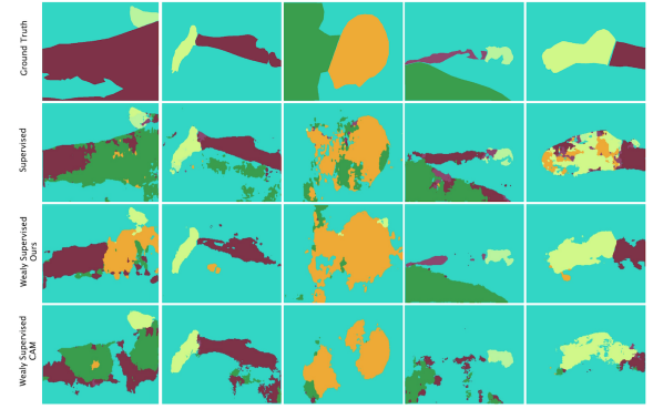
Fig. 2. Comparing the semantic segmentation performed by a supervised and two weakly supervised models on a few images from the test set. In the supervised approach the model is trained on only the 1036 manually labeled images where as in the weakly supervised approaches the models are trained on 1036 manually labeled plus 5965 pseudo-labeled images.

In most cases, the VGG-based U-Net produces better and more consistent results. The deeper the model the more sensitive it is to noise, and it converges much slower especially when training it with pseudo labeled data. Our proposed method, further refines the pseudo labels at a pixel level by ensuring the consistency between the manually-provided labels for the sequences and CAM-based labels. Training VGG and ResNet with only our refined pseudo labels increases the mean IoU and frequency-weighted-IoU by 3.36%, 2.58%, 10.39%, and 12.91% respectively. Furthermore, the seg-