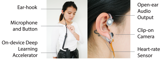
Figure 2. Wearable device with on-device deep learning, camera, open-ear audio output, microphone, and heart-rate sensor.