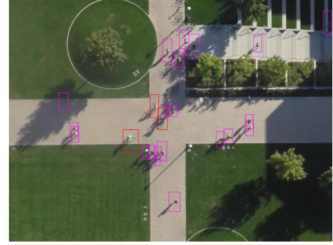
Fig. 2. Sample from the Stanford Drone Dataset (which is not included in the Trajnet++ benchmark). The environment would play an important role in order to predict trajectories that do not go on the lawn.

b) Other methods. : Even though non-RNN methods cannot take advantage of the research on interaction modules, alternative machine learning approaches have been developed. Convolutional Neural Networks are faster than RNN-based methods due to parallelization, but the performances are significantly lower [18]. Some authors have explored the popular Transformers architecture, but the results are inferior to