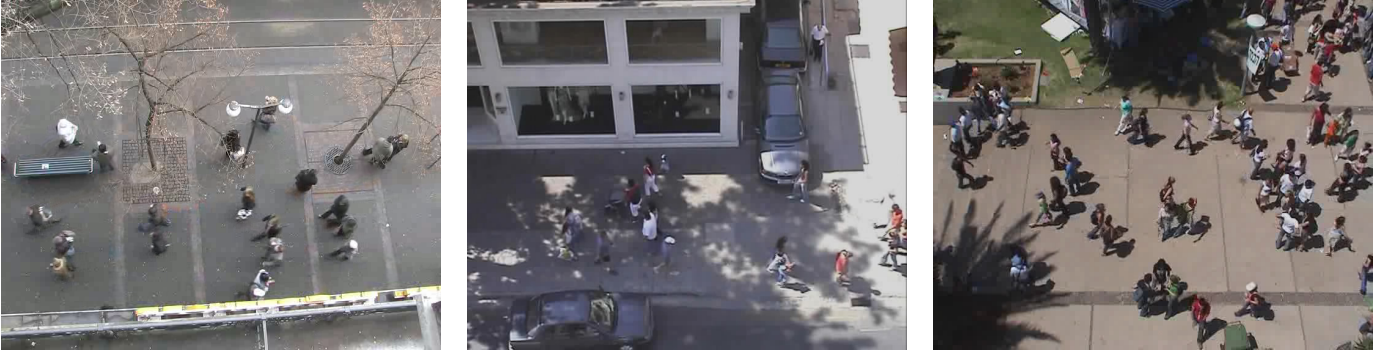
Fig. 3. Images from different datasets from which the Trajnet++ benchmark trajectories are extracted. Left: ETH-hotel dataset - Center: UCY-zara dataset - Right: UCY-students dataset.

addition to purely spatial errors, in order to produce physically feasible trajectories.