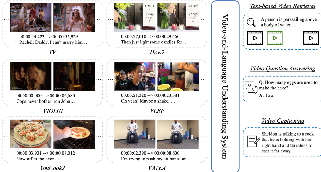
Figure 1: An illustration of VALUE benchmark. VALUE provides a one-stop evaluation for multi-channel video understanding on 3 common video-and-language tasks: (i) text-based video retrieval; (ii) video question answering; and (iii) video captioning. The videos in VALUE come from 6 data sources, covering diverse genres and domains.