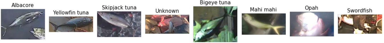
Figure 2. The 8 most common L1 fish species in Fishnet. Examples selected at random and cropped by bounding box.

the Fishnet Open Images Database, a large dataset for detection and fine-grained visual categorization of fish species onboard commercial fishing vessels. The current release of the dataset (version 0.3) consists of 406,463 bounding boxes in 86,029 images sourced from 73 different electronic monitoring cameras, making it the largest and most diverse public dataset of fisheries electronic monitoring imagery to-date. Version 0.3 is limited to imagery from a single fishery in a relatively large geography (longline tuna in the western and central Pacific Ocean), however the challenges in this fishery are emblematic of many other large-scale industrial fishing operations around the world.