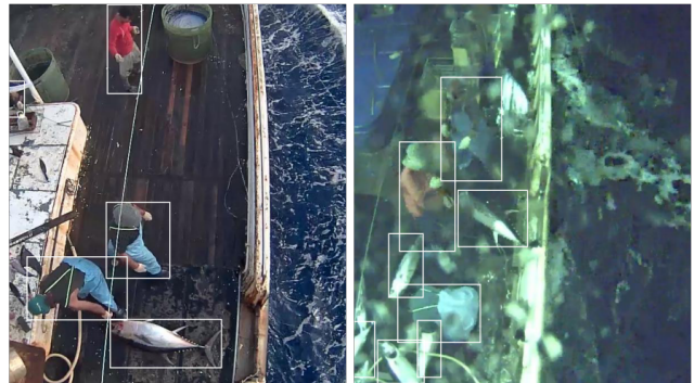
Figure 1. Two example images from the Fishnet dataset, captured by EM cameras mounted above the deck on longline tuna vessels. (Left) Ideal conditions: good lighting, high visibility, and no occlusion. (Right) Challenging conditions: low visibility due to harsh weather, water on the lens, artificial lighting, and hectic crew activity which occludes the fish.

More than a thousand commercial fishing boats carry electronic monitoring (EM) systems, which use onboard cameras to track fishing activity and provide accountability in the global seafood market. These systems produce large volumes of video data that are screened by trained human reviewers. Over the next ten years, the number of boats carrying electronic monitoring systems is expected to grow by 10-20x, outpacing current review capacity [26]. Computer vision has the potential to drastically reduce the time required to analyze this video by automatically detecting and classifying fish. However, the lack of publicly available data in this domain, and the systemic barriers to obtaining