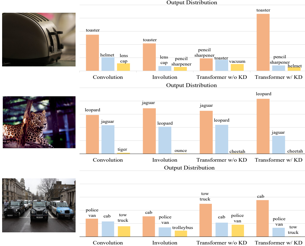
Figure 1: Class probabilities predicted by a CNN, an INN, a transformer without distillation, and a transformer distilling from both CNN and INN. CNN and INN provide come up with consistent (the first row) or complementary (the second and third rows) conclusions to correct transformer’s prediction.

models. We believe that their inherent inductive biases (spatial-agnostic and channel-specific in convolution, spatial-specific and channel-agnostic in involution) could drive them to harvest different knowledge even though they are trained on the same dataset (see Figure 1). Therefore, teachers of different inductive biases could make different assumptions of the data and look at the data from different perspectives. In contrast, teachers with similar inductive biases but different performance (e.g., ResNet-18 and ResNet-50) have little difference in data description. Thanks to complementary inductive biases from different types of teachers, our method only requires two super lightweight teachers (a CNN and an INN), both of which are very easy to train. In the distillation stage, the knowledge from teachers compensates each other and significantly prompts the accuracy of the student transformer. The main contributions of this paper is four-fold: