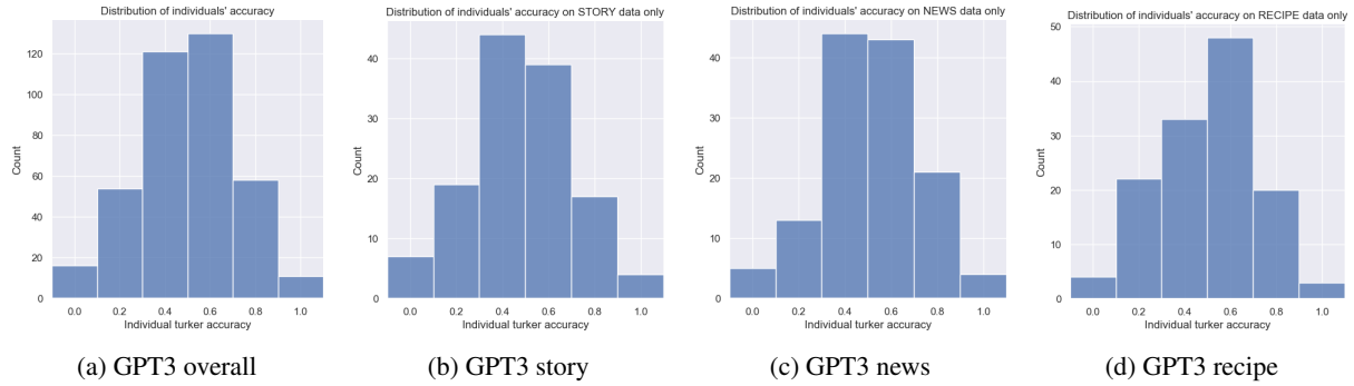
Figure 4: Histogram of scores classifying human and GPT3 texts.