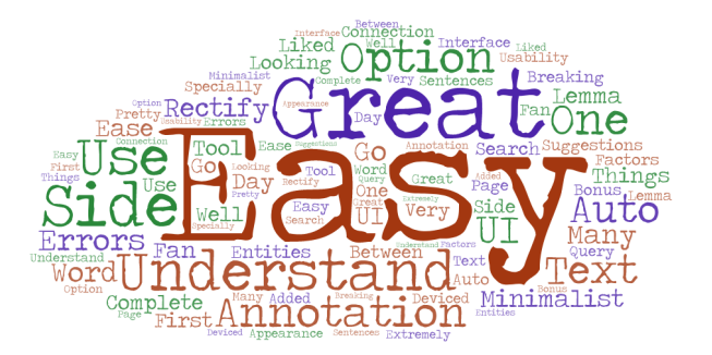
Figure 3: Wordcloud of user testimonials

Table 5 shows the ratings given by the users. Figure 3 shows a word-cloud representation of the testimonials provided by the users.