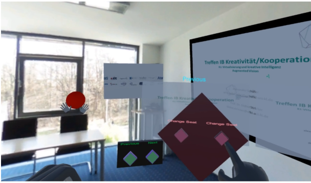
Figure 4: Virtual objects can be placed by the user in the virtual environment to enable interaction.

headset position in virtual space. This is used for certain gestures e.g. a swiping gesture towards the projector will change slides only when the projector is being looked at. We also use a menu which appears when the left palm is facing the VR headset. The user can grab objects from the menu and place them in the virtual world, where they expand and allow interaction (See Figure 4). Interaction possibilities include: moving to a different seat, changing projector slides and preview for upcoming slides.