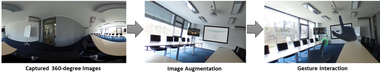
Figure 1: Our virtual reality meeting room using the proposed method.

German Research Center for Artificial Intelligence TU Kaiserslautern