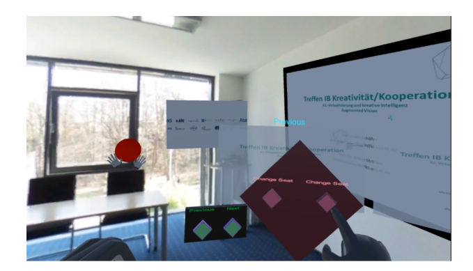
Figure 4: Virtual objects can be placed by the user in the virtual environment to enable interaction.

MuC '19, September 8-11, 2019, Hamburg, Germany