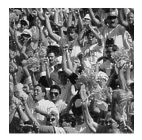
(d) [9, Algorithm 8]. PSNR = 28.5764

Figure 3: The recovered images using different algorithms for 1000 iterations.