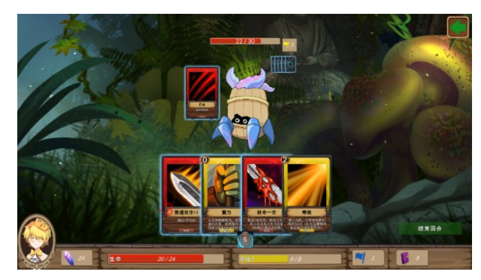
Fig. 2. Screenshots of Dream Cage , the card game that we developed and used to conduct our experiment. The picture is the battle screen, where players face opponents and must deplete the opponent's health bar by selecting which card(s) to play next. In the screenshot, the player lost four health points.

and we used questionnaires to evaluate the game experience in each condition.