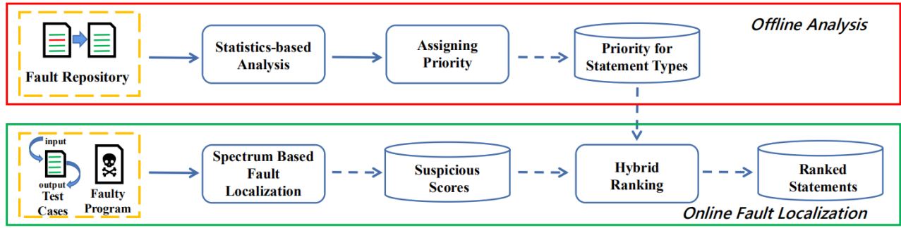
Figure 1: Overview of HybridAFL

and mutation-based fault localization (MBFL) [24, 26, 27, 46] work on both coarse-grained and fine-grained software entities, varying from statements to modules. Besides such generic fault localization approaches, some approaches are specially designed for coarse-grained fault localization. For example, information retrieval (IR) based fault location [31, 50] ranks potentially faulty elements (methods or classes) by computing their lexical similarity with bug reports. BLUiR [32], proposed by R.K.Saha, parses source file and extracts identifiers as well as code structure information. Based on such information, it leverages IR techniques to compute the similarity between source code and bug reports.