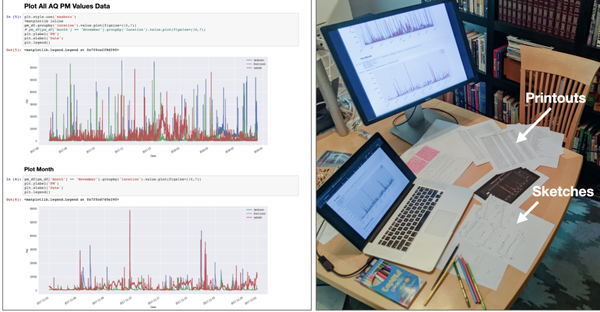
Figure 3: Left: A screenshot of the data analyst’s Jupyter notebook used to process and display participants’ data. This view was mirrored between the analyst’s laptop and external monitor when presenting data to participants. Right: A typical data engagement interview setup. Interviews included physical printouts of a participant’s data to help them to understand what data was available. Some participants also used sketching to communicate how they imagined using their data to the interviewers and data analyst.

consisted of 3 air quality monitors that logged measurements at 60-second intervals over several months; a table of algorithmically detected spikes [64] from each monitor data stream, including the time, location, monitor ID, and spike value; a table of outbound text message alerts sent to participants based on these detected spikes, including the message timestamp, content, and spike location; and a table of participants’ replies to these messages, including the reply timestamp, content, and annotation source (text, tablet, or Google Home).