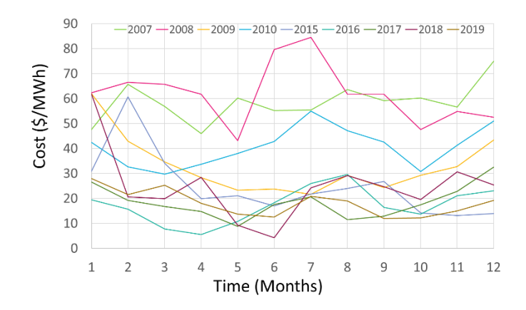
Figure 1. Monthly Averages for North Zone Hourly Time Weighted Integrated Real-Time Energy Costs by Year.