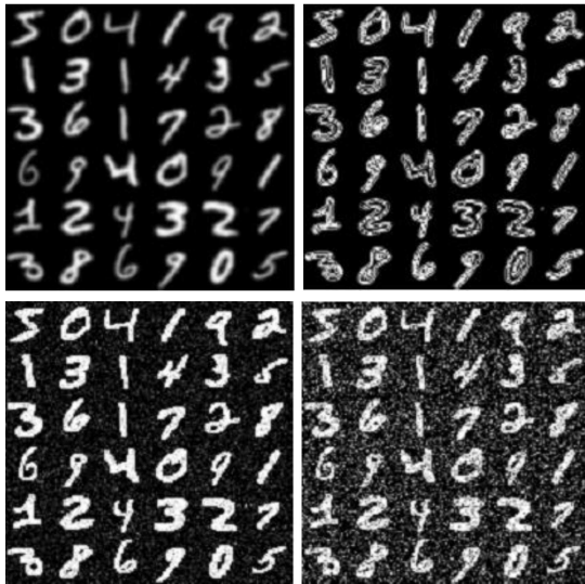
Fig. 2: Counterpart images of those shown in Fig.1. The 4 sub-figures correspond to 4 different image processing operations, respectively. See the text in subsection IV-A for details on the operations.

See Figs.1-4 for several original images and their counterparts in the generated datasets. Denote the original dataset MNIST by MNIST-D0 and the newly generated datasets by MNIST-D i , i = 1, \dots, 4 . MNIST-D i is generated with Operation i , i = 1, \dots, 4 . We obtain FasionMNIST-D i , i = 0, \dots, 4 , in the same way. Then we train one CNN model based on each dataset. Only the training samples included in each dataset are used for model training. The remaining testing samples are used for performance evaluation of the involved model selection methods.