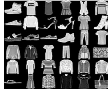
Fig. 3: Image samples drawn from the FasionMNIST dataset.

For each dataset aforementioned, we train a CNN model to