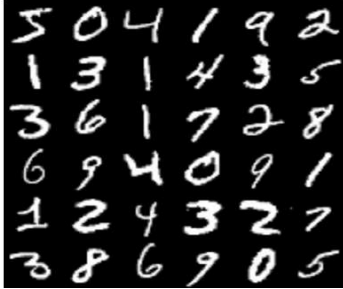
Fig. 1: Image samples drawn from the MNIST dataset.