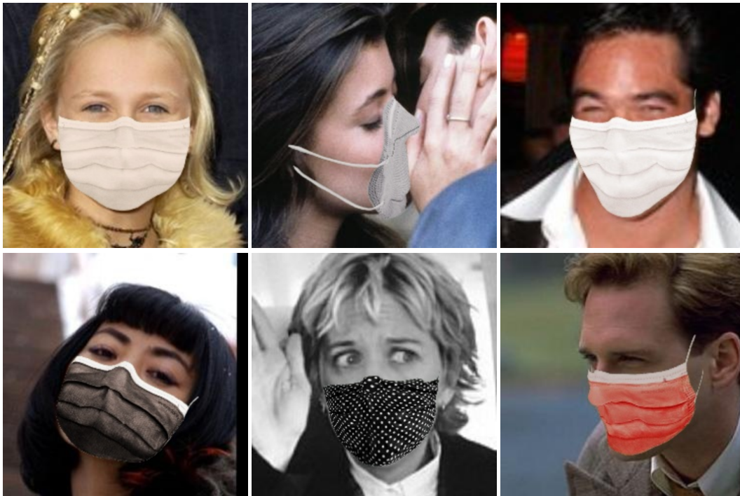
Figure 3: Examples showcasing key features of our method. Our method relies on SparkAR to correctly predict face positions for various poses of the subjects, even when they are looking in a direction perpendicular to the camera. In such cases, the corresponding parts of the mask are automatically occluded. SparkAR can also recognize facial expressions and modify the 3D mask accordingly, e.g. stretching the mask when appropriate. Color matching the original image helps to blend in the mask over the context image, thus creating a more realistic sample. Best viewed in color.