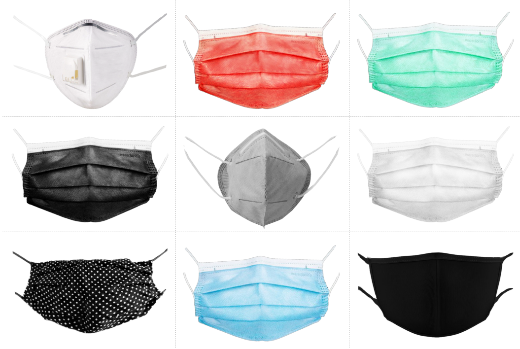
Figure 1: Mask database. Our mask database contains 9 masks that vary in color, shape and texture. Best viewed in color.