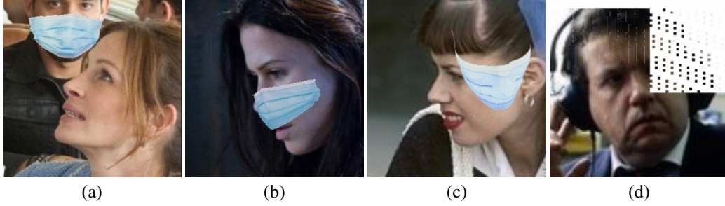
Figure 4: Failure cases. In less than 3% of the images, the data sets might exhibit the following errors: (a) mask applied on wrong person, (b) mask covering the face only partially, (c) mask not covering the face, (d) compression artifacts. Best viewed in color.

SparkAR and Dlib-ml fail to produce a mask and this accounts for the remaining 3.2% of all images in the CelebA data set.