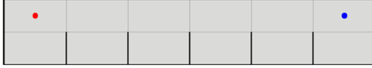
Fig. 1. The initial state of the single road game board. The red circle is controlled by the human player and the blue circle is controlled by the autonomous agent. Both players must reach the opposite side of the board without colliding. The players may travel freely on the upper row, but they cannot advance when located on the lower row.

We introduce our Socially Aware Reinforcement Learning agent (SARL), an agent that attempts to maximize the linear combination of the two utility functions, using our proposed formula. We show that SARL significantly outperforms all other baselines in the single track road game when interacting with humans, in terms of the agent’s final outcome. Somewhat less surprisingly, humans interacting with SARL also achieve the highest outcome. Therefore, SARL not only perform better with respect to its own outcome, but also with respect to social welfare.