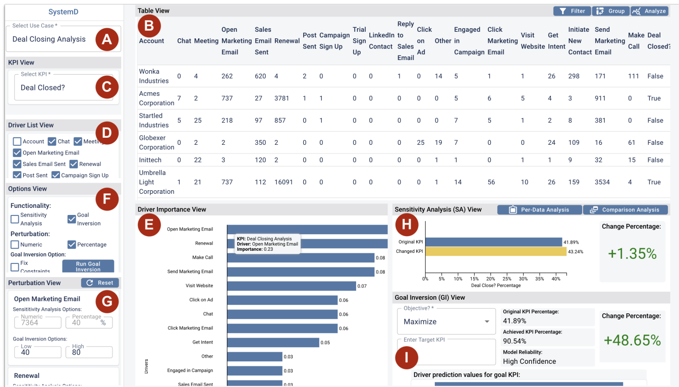
Figure 2: SYSTEMD user interface showing a snapshot from the deal closing analysis use case. It operationalizes four functionalities we deem necessary for augmenting decision making in data analysis systems. See Section 2 for details on each of the annotated views.

importance values range between -1 and 1 with extremes showing high negative and positive importance to the KPI respectively while closer to 0 shows low importance to the KPI.