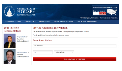
(a) House.gov Find My Rep Interface

To quantify possible coverage gaps in Wikipedia, we measured how many Wikipedia pages for California places ( cities, towns, etc. ) mention the name of at least one member of Congress? To do this we randomly sampled 2,000 listed places from the child articles of the Wikipedia page "List of Places in California". We then searched for the presence of the name of a California member of Congress in the resulting articles. We found that less than half of Wikipedia pages (42%) contained the name of a member of the California congressional delegation.