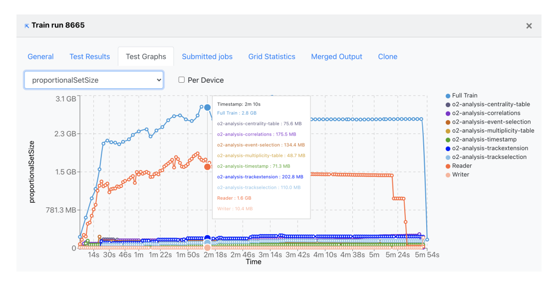
Figure 2: Train run test performance result. The proportional set size memory of all workflow tasks in the train run are displayed.