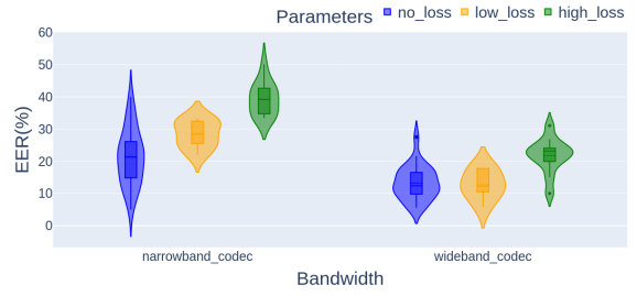
(d) Effect of bandwidth and packet loss