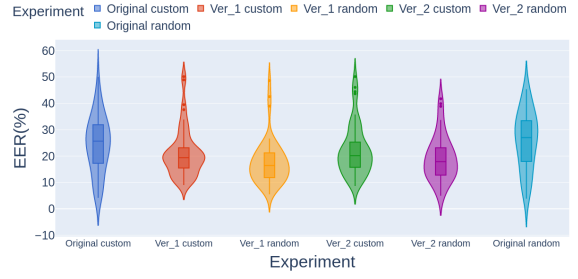
(b) Performance comparison of the systems mentioned in Table 2