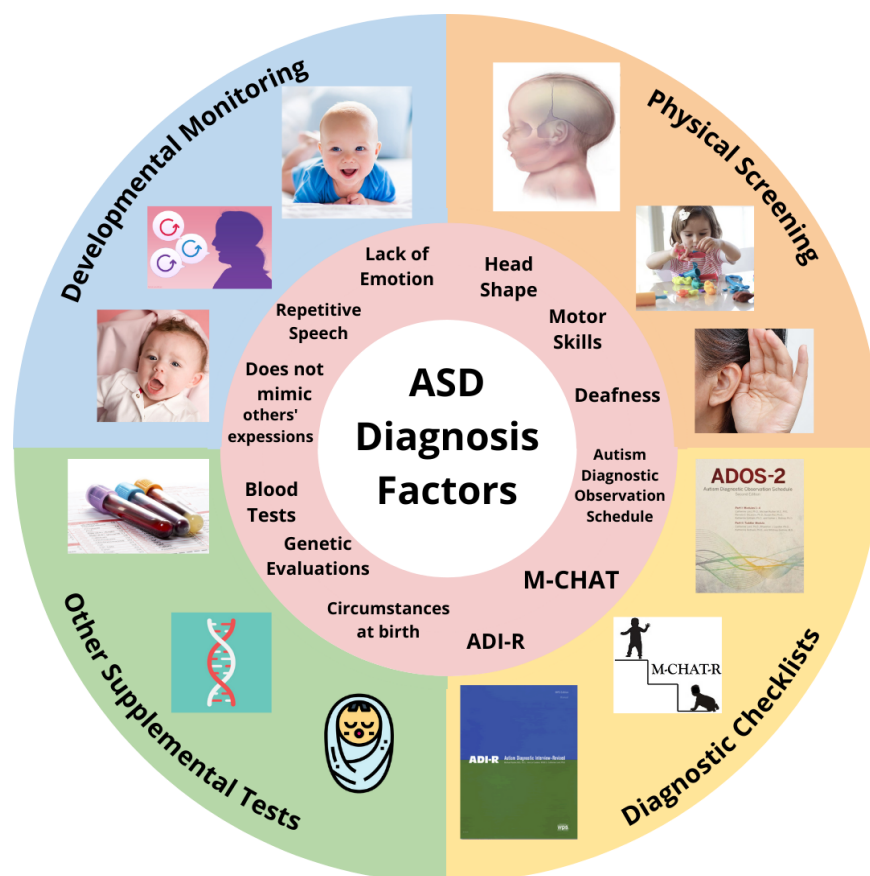
Figure 1: Diagram of current clinical procedures in an ASD diagnosis, consisting of four major steps: 1. Developmental Monitoring; 2. Physical Screening; 3. Diagnostic Checklists; and 4. Other Supplemental Tests. These 4 steps analyze both the social behavior and the facial features of the patient, and there are occasional supplemental tests as well to look into other possible factors that may contribute to the disorder.

patient is not deaf instead of assuming that the patient has ASD. Then, a patient's behavior will be assessed through the use of checklists, like Autism Diagnostic Observation Schedule, Autism Diagnostic Interview-Revised, Modified Checklist for Autism in Toddlers, and more. Finally, specialists complete other supplemental tests with an in-person evaluation [4-6].