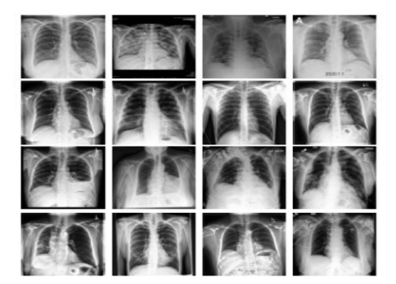
Fig. 1. Images from the COVID X-Ray dataset.