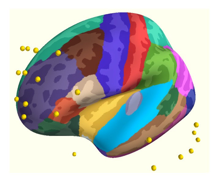
Figure 1: Subnetwork electrodes corresponding to auditory perception cortical areas

change when we change the music stimuli (thus changing the tempo), which indicates the validity of the results.