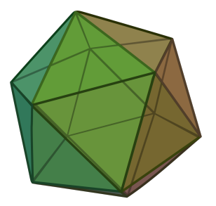
Figure 3: A regular icosahedron in \mathbb{R}^3 .