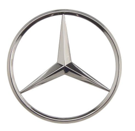
Figure 1: The Mercedes-Benz frame (4.9) on the xy -plane.