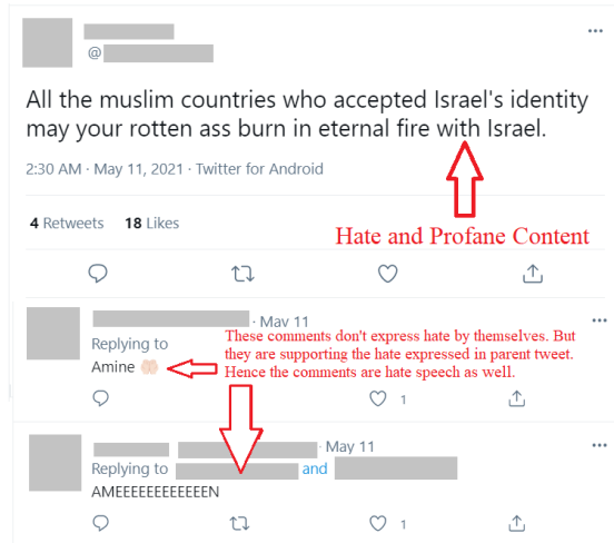
Figure 1: Example of conversational Hate speech