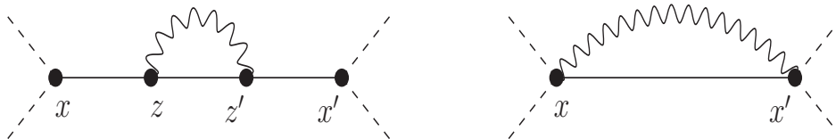
Figure 1: The left diagram shows how the self-mass (3) contributes to massive scalar scattering. The diagram on the right gives the contribution from graviton correlations between the vertices. Solid lines represent the massless scalar, wavy lines represent the graviton, and dashed lines are massive scalars.

A technique has been developed for removing gauge dependence from effective field equations by including quantum gravitational correlations with the source which disturbs the effective field and the observer who detects it [33]. The procedure is to build the same diagrams (Figure 1 gives two examples) that would go into an S-matrix element, and then simplify them with a series of relations derived by Donoghue [34–36] to capture the infrared physics. In the end only vestigial traces of the source and observer remain, and each of the simplified diagrams can be regarded as a correction to the 1PI 2-point function in the linearized, effective field equation.