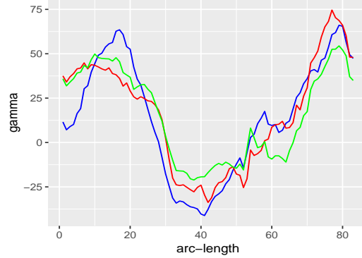
Figure 2: Estimators of \gamma with different expected missing length on [0, 1] . Blue line: the estimator using original complete dataset; Red line: the estimator with (a_1, a_2) = (1.5, 0.2) ; Green line: the estimator with (a_1, a_2) = (1.5, 0.4)

Estimators of functional coefficient obtained by both complete and incomplete FA dataset are illustrated in Figure 2. It shows that estimators obtained by incomplete dataset with different missing domain (red line and green line) are similar to the estimator obtained from original complete dataset (blue line). This reveals that the proposed framework is useful in getting an estimator for the model with incomplete functional predictors.