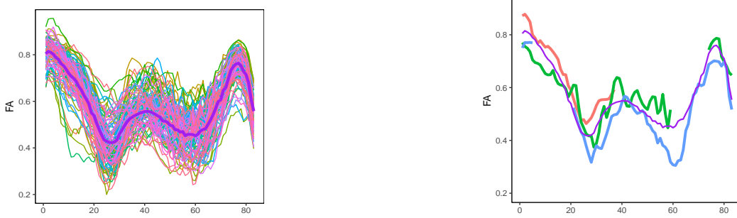
Figure 1: A part of complete (left) and incomplete (right) FA curves with mean function (purple line)

Our main interest is characterizing the dynamic relationship between FA and mini-mental state examination (MMSE) score which is seen as a reliable and valid clinical measure in quantitatively assessing the severity of cognitive impairment. FA is measured at 83 equally spaced grid along the corpus callosum (CC) fiber tract that is the largest fiber tract in human brain, and is responsible for much of the communication between two hemispheres, and connects homologous areas in two cerebral hemispheres.