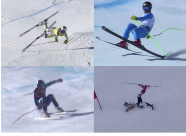
Figure 1. Example images of our injury specific 2D dataset