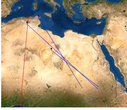
Fig. 2. The red marker and line indicate the Sidi Ghanem Mosque and its orientation. The blue markers and blue full lines indicate the locations and bearings Sidi 'Ukba Graveyard and the Zawailah mosque. The blue square is the optimal reconstruction point of cluster Ma. The reconstruction point MA is not at the intersection of the blue lines because there are also some small contributions from sites in the Levant. The blue marker with the dashed line illustrates the only mosque in Magreb between 700 CE and 750 CE.