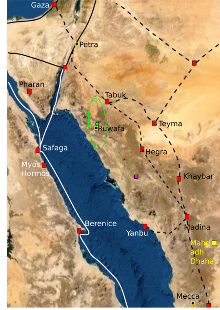
Fig. 4. The green curve is placed around the 95 % confidence region based on a compression with s = -29 . The green dot is the optimal reconstruction point of the cluster Ru. The purple marker indicates the midpoint between Petra and Mecca along a great circle.

In order to calculate a confidence region for the reconstruction point Ru we fix the reconstruction points for the cluster Pe to Petra and fix the reconstruction point of the cluster Je to the Dome of the Rock in Jerusalem. With these reconstruction points fixed we calculate the optimal reconstruction point of cluster Ru and calculate a confidence region around this point.