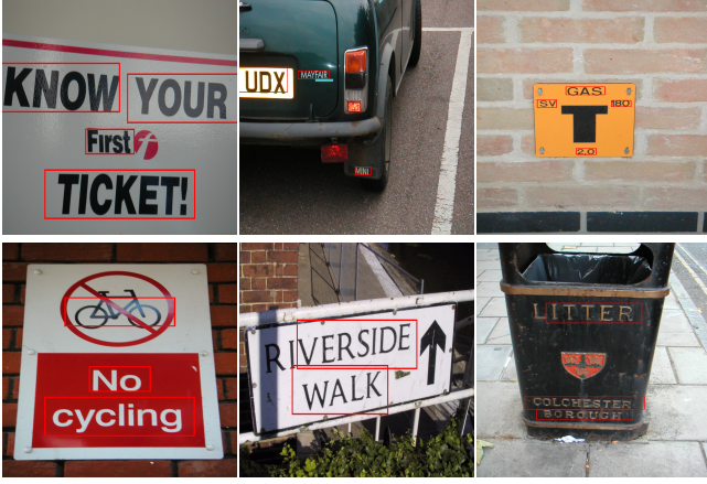
Fig. 1: Examples of detections made by our supervised model on ICDAR2013; red rectangles are predicted bounding boxes