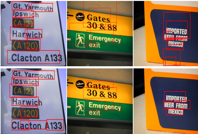
Fig. 2: Examples of predictions on ICDAR2013 using the weakly supervised model (top row) and the semi-supervised model (bottom row); rectangles are predicted bounding boxes

is still very imprecise and produces too many false positive detections. We attribute this to the assessor’s sensitivity to textured backgrounds. Figure 3 shows the assessor prediction results compared to the ground-truth IoU values for some example background regions in real-world images. Whereas it correctly predicts a low IoU value for many background areas, as in the last example, it sometimes predicts rather high values (between 0.30 and 0.60) for regions with repeating patterns. This leads to many trigger actions by the RL agent on non-text areas.