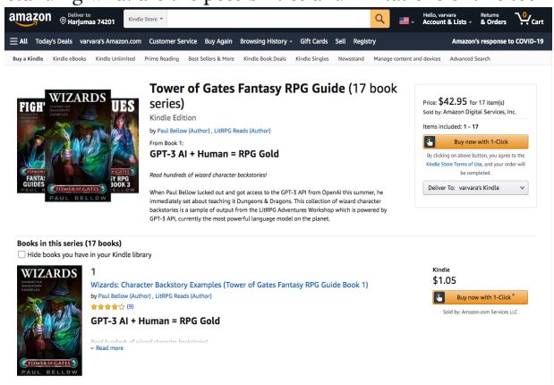
Figure 1: AI-generated books sold on Amazon. A screenshot from Amazon website.

Let us consider technology beyond its economic value and think in the context of creativity and art. What kind of new tools and concepts is it able to offer to us? How can novel AI technology expand our creative horizons? At the same time, we cannot forget that artificial intelligence, machine learning, and neural network are currently the catchwords for innovation. Saying this, I think it is essential to explore case studies discussed below, and beyond them in order to come to an understanding what are the possibilities and limitations of this technology.