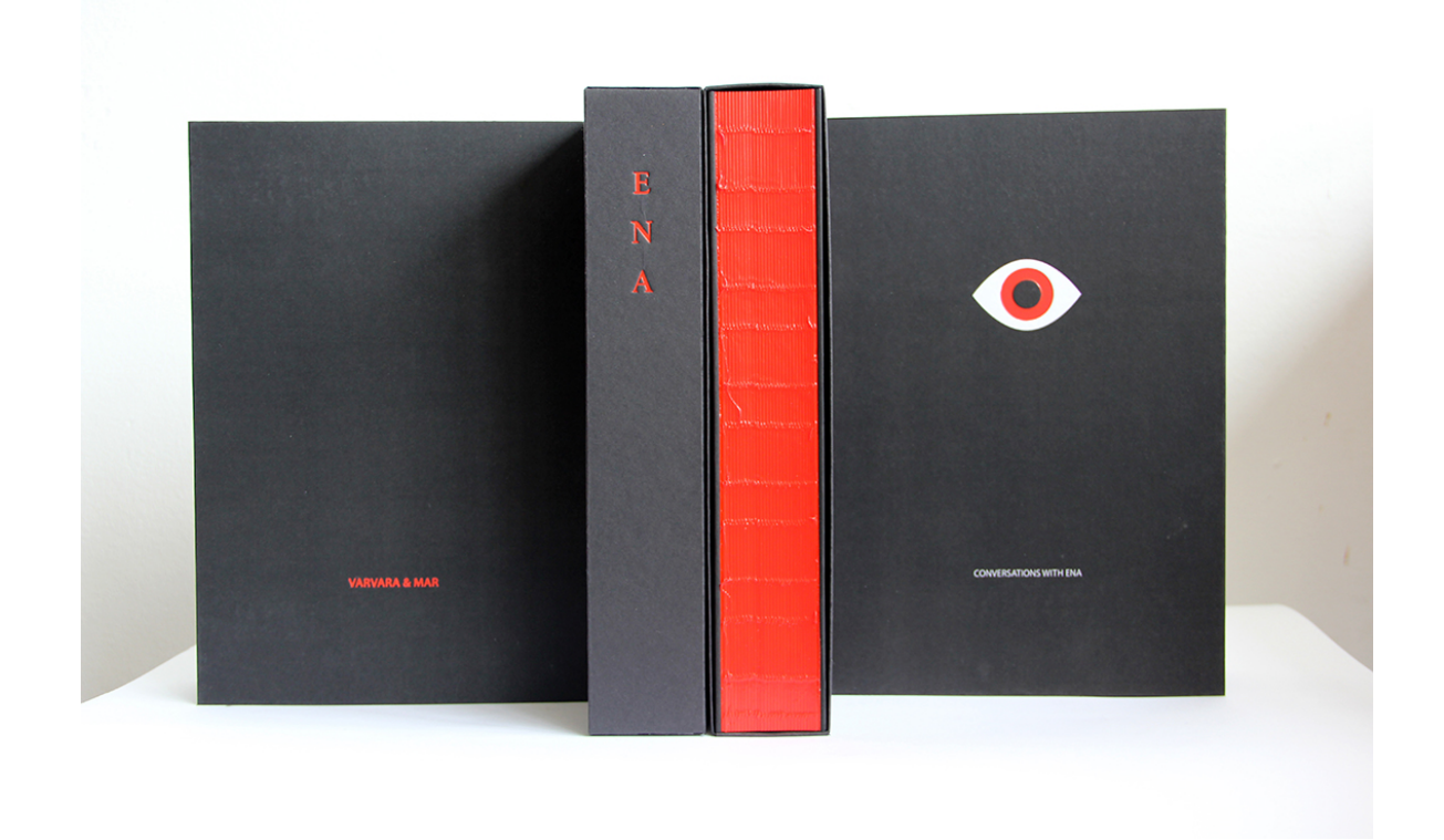
Figure 3: Publication of ENA project.

spirits or comfort us. ENA has only been conceived to talk or, in other words, to do theatre. More precisely, we used a classical theater technique by integrating stage directions to the conversations between the participants and ENA. Here are some pre-made directional scripts to illustrate the idea: A country road. A tree. Evening; Silence; ENA smiles sadly and strokes her hair; ENA is alone, walking about uneasily; Pause; ENA does not move. This way, the dialogs were in a way seamlessly curated. As a result of this approach, we ended up with many intriguing, funny, and rich conversations. After reading the text saved in the system's log files, we realized that the dialogs carried social and cultural value, which illustrated the current chatbot's ability to engage with human beings and another way around. In addition to that, the project demonstrated that the curated conversations via stage directions, in this case, enable more playful and engaging conversations with a chatbot. These experiences were captured in a hand-bonded 900-page book titled "Conversations with ENA. I'm stupid and I try to pretend like I know what I'm talking about." (see Figure 3) [8].